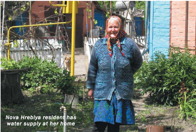
Nova Hreblya resident has water supply at her home

“...Turning the tap will replace for us tiresome trips to the well with water-pails, will give us the opportunity to water our vegetable gardens in the drought season. Water, as an element, is very diverse in its manifestations – it can be both life-giving and destructive. Let it be only the life-source for our villagers...The bidding will occur pretty soon, and then, if we are lucky – we’ll be constructing water conduit. We can already taste pure sweet water, its silver drops – fresh and cool, as they are. Just dreaming?” – these poetic lines were part of the project proposal submitted to DESPRO by the self-organization group “Street Committee “Vy dumka-Center” from Nova Hreblya village of Kalynivka rayon (Vynnytsya oblast).