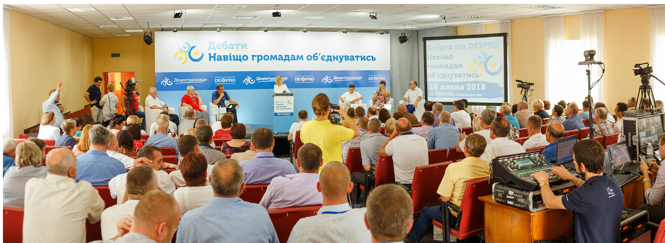
Public debate “Why communities should amalgamate” in Yampil, Vinnytsia reg.

information and educational videos, covering various reform-related topics, which have been viewed by millions of Ukrainians.