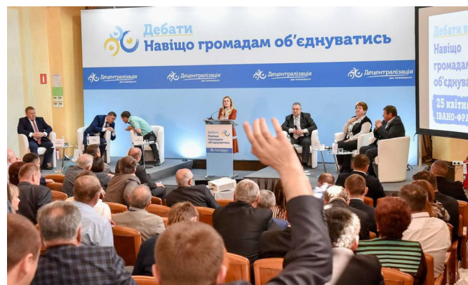
Public debate "Why communities should amalgamate" in Ivano-Frankivsk

Producing videos that show successful examples and practices of the reform implementation and keeping a steady stream of such videos in the media has been one of the key tasks of the project communication team. DESPRO produced more than a 100