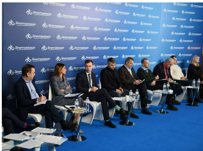
The panel discussion “Starosta [village leader]: the role, its purpose and tasks” broadcasted online in 2021