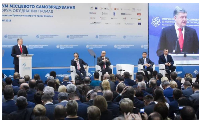
Forum of Amalgamated Communities in 2018

3 LSG Forums have been organized since 2016, with around 1000 participants each time. The Forums featured addresses by the President, the Prime Minister, the Chairman of the Parliament, and representatives of international partners of Ukraine. Each year, the most important topics of LSG are discussed, and priorities for the following year are determined.