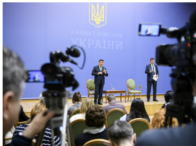
The Prime Minister Volodymyr Groisman during the press conference on decentralization, organized specifically for regional media, 2017